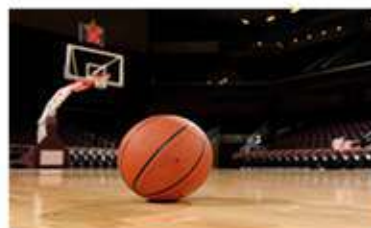
Basket Ball Court