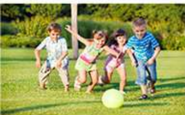
Kids Playing Area